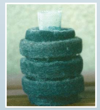
After 2nd 500 gallon treatment