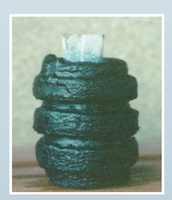
After 1st 500 gallon treatment